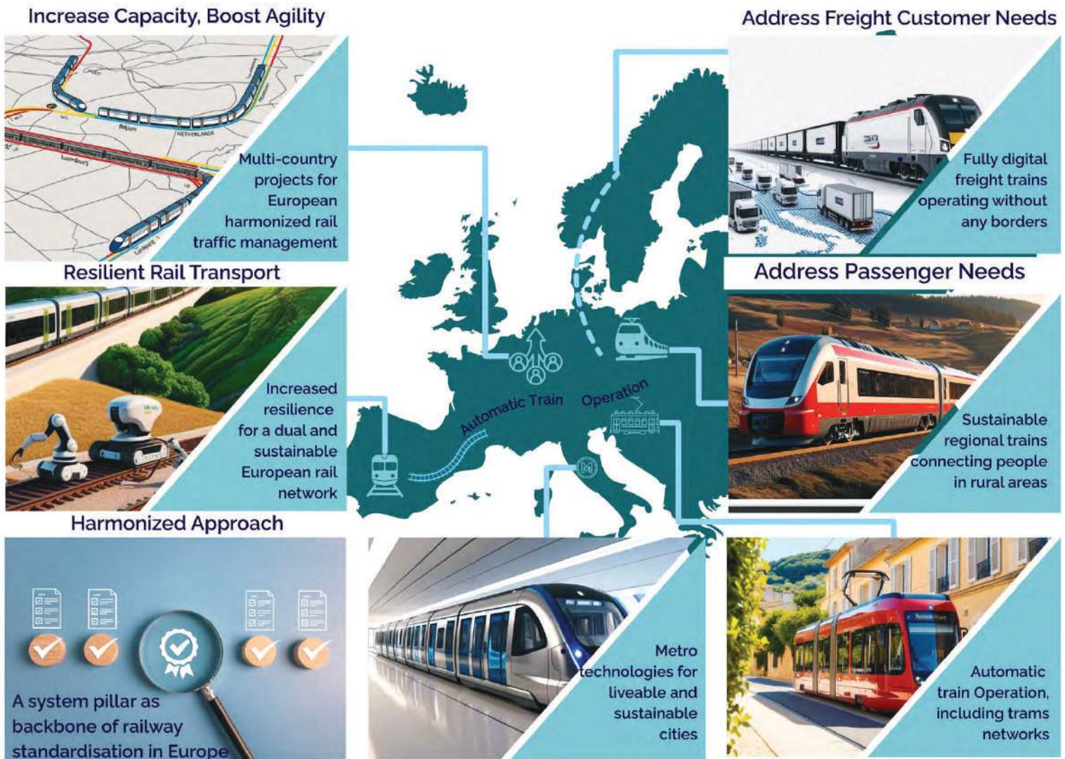
Figure 2. Vision of achievable goals from a new R&I programme